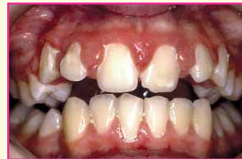
Damage caused by the brace due to sugary snacks/drinks and poor brushing.

Sugary snacks/drinks and poor cleaning of your teeth and brace will lead to permanent damage to your teeth as shown in the picture below.