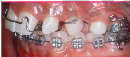
A removable brace on the top teeth and a fixed brace on the bottom teeth.

Your speech will be different at first. Practice speaking with the brace in place e.g. read out aloud at home on your own. In this way, your speech will return to normal within a couple of days. To begin with you may produce more saliva and have to swallow more than normal. This is quite normal and will quickly pass in a couple of days.